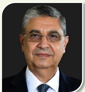
Dr. Mohamed Shaker Minister of Electricity and Renewable Energy