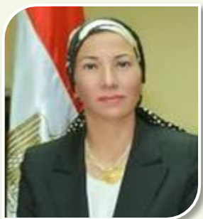
Dr. Yasmin Fouad Minister of Environment