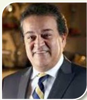
Prof. Khaled Abd Elghafar Minister of Higher Education and Scientific Research